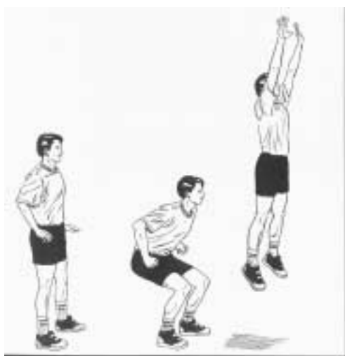
Figure 2: Countermovement jump (Hoffman, 2002, p. 145)

(Bosco & Komi, 1979, p. 282). In addition, the prestretch during the countermovement results in a greater neural stimulation (Schmidtbleicher, Gollhofer & Frick, 1988, pp. 187-188) as well as an increase in the joint moment (a turning effect of an eccentric force, also referred to as torque at the start of the upward movement (Kraemer & Newton, 2000)). The greater joint moment results in a greater force exerted against the ground with a subsequent increase in impulse (greater force applied over time) and acceleration of the body upward. Bobbert et al. (1996, p. 1411) have suggested that this latter mechanism may be the primary reason for the greater jump height observed during a countermovement jump, whereas the other mechanisms may play more of a secondary role.